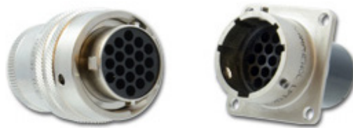
Figure 2: Amphenol LPT series

The LPT connectors are based on Amphenol's MIL-C-26482 series I and the original PT series but have an aluminum shell design that helps with the EMI protection. This metal connector, with improved structure, also features a standard PT shell with coupling nut, making it inter-mateable with the PT series. There are five shell styles, including box mounting receptacle, jam nut receptacle, straight plug, wall mounting receptacle and cable connecting receptacle, and a variety of finishes, including black zinc, nickel and gray zinc nickel