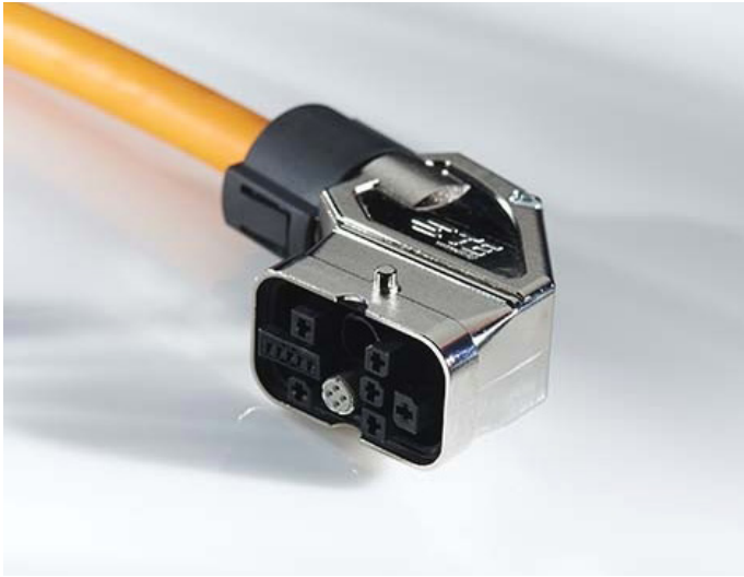
Figure 4: TE Motorman connector

The metal shells of the UTO are strong and rugged to resist every environmental and mechanical requirement for indoor and outdoor applications. Amongst several characteristics, UTO offers possibilities on shielding, sealing, and salt spray through 8 shell sizes, 27 insert arrangements, and inter-mateable with the UTG, UTP, and UTS connector series. Mixed power and signal layouts can be included for single connector systems, with EMI attenuation of 98 dB at 1 MHz to meet the UL and IEC standard requirements.