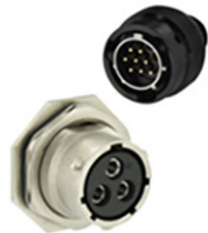
Figure 3: Souriau – UTO series

Using this contact technology and based on the same connector design, the UTS, UTG and UTO series are interchangeable and inter-mateable. See Figure 3. These series also offer the quick-mating 1/3-turn-bayonet coupling system. The UTO is built using zinc and aluminum alloy for full EMI shielding with IP67, IP68 & IP69K in mated condition, while the ruggedized plastic UTS offers a lighter weight option and both offer a waterproof rating to IP68/69K. There are also multiway connection options in the lightweight bayonet UTG version.