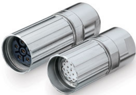
Figure 5: Smiths Interconnect M23 series

The open barrel crimp contacts can accommodate a wider range of wire gauges and so can be used to limit the number of contact types required on applications containing mixed cable sizes. These are aimed at motor-drive applications such as machine tools, robots, conveyor systems, handling machines and elevators.