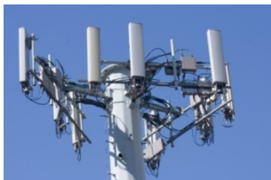
Broadband Wireless Access