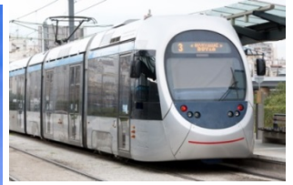
MRT / Railway