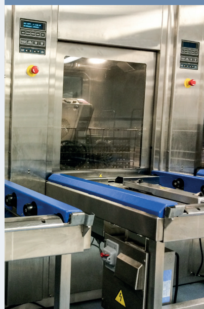
Sterilizer for books, washer for medical, UV sanitizer...