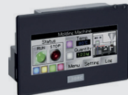
PLCs WITH TOUCH PANEL