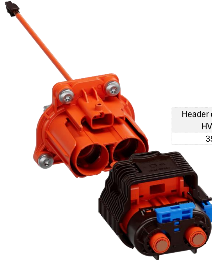
Header connector with HVIL jumper