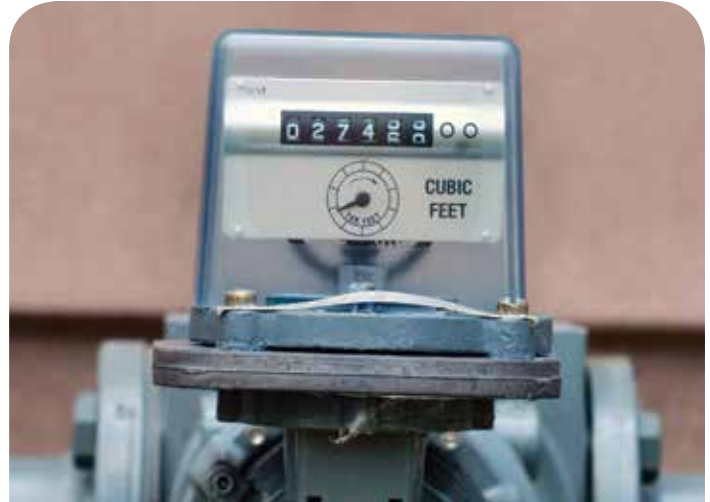
Gas leak detection

Customer Benefits: Honeywell's Zephyr™ airflow sensor may be used in a vacuum pump monitor to accurately measure the flow of the vacuum so that the desired levels are achieved. The more accurate the measurement, the more accurately the process can be controlled.