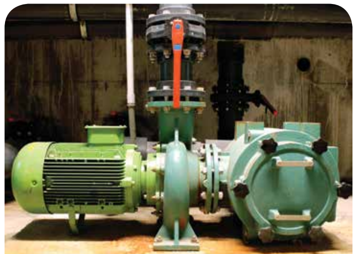
Vacuum pump monitoring