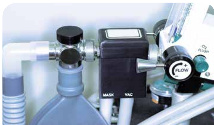
Anesthesia delivery machine

Zephyr sensors are designed to measure mass flow of air and other non-corrosive gases. Standard flow ranges are 10 SLPM, 15 SLPM, 20 SLPM, 50 SLPM, 100 SLPM, 200 SLPM or 300 SLPM. The sensors are fully calibrated and temperature compensated with an onboard Application Specific Integrated Circuit (ASIC).