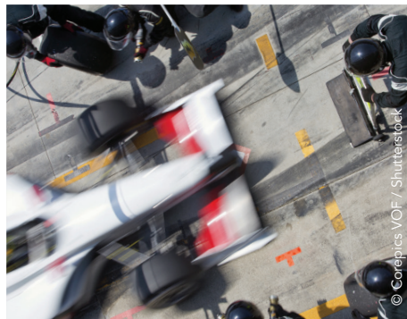
Data Acquisition System