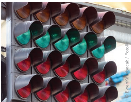
Telemetry & Network