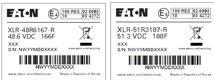
Figure 1. Existing product labels.

XLR products will no longer carry UN ECE R10 and R100 certification. The product label will be changed from the current label shown in Figure 1 to the new label shown in Figure 2. There is no design change to the product. The datasheet will also be changed to indicate “designed to meet UN ECE R10 and R100 requirements,” rather than full certification.