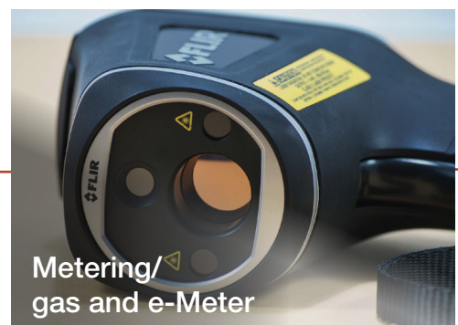
Metering/ gas and e-Meter