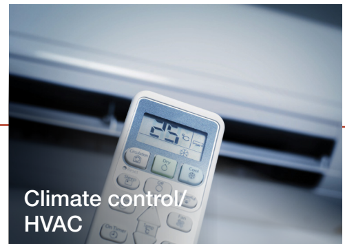
Climate control/ HVAC