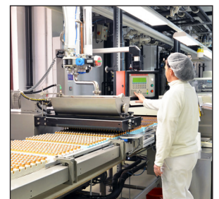
Food and Beverage Equipment