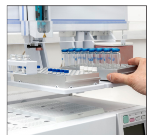
Test and Measurements here