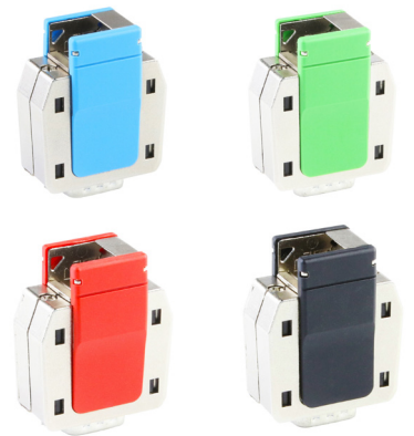
Jewel Backshells for D-Sub Connectors

Jewel Backshells for FCT D-Sub Connectors offer cable management by enabling a straight to 45-degree adjustment of the d-sub connector's orientation and provide click-and-close assembly, protection and strain relief