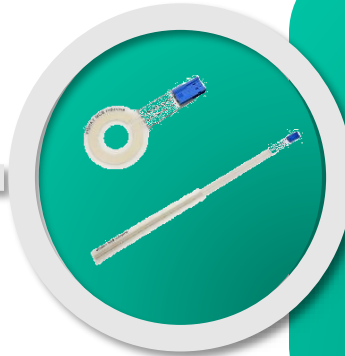
UIPMA Series Linear potentiometer